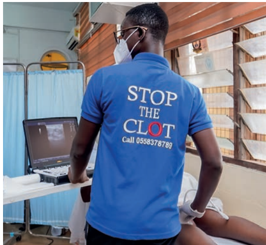
DVT Team member wearing the shirt

The DVT Team at KATH designed blue polo shirts with the motto: „Stop the Clot“ and the telephone number of the DVT Team. Each member of the DVT Teams at KATH, Kumasi South Hospital and Agogo Presbyterian Hospital received one of the T-shirts.