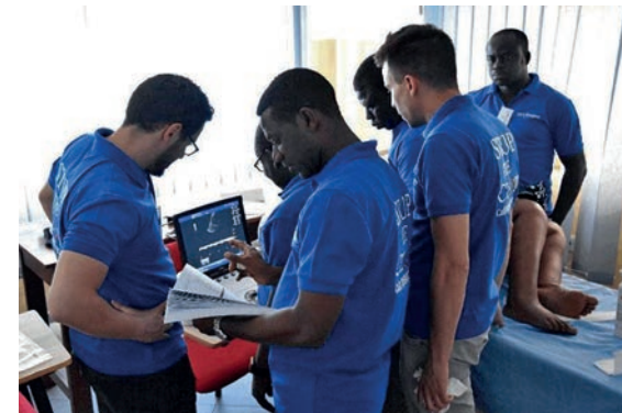
DVT Team members during a training programme

ferent departments in these hospitals participated in the workshops. Over 200 healthcare workers, including the DVT-Team, participated in these workshops. The workshops were moderated by the DVT Team members.